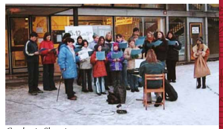
Carolers in Slovenia (http://goo.gl/ND4Pvp)

New Year's Eve, in socialist times the major year-end festival, remains today in Bulgaria a big family holiday , with traditional survakane January 1<sup>st</sup>. Everyone, whatever their religion, can celebrate the end of the Western civil calendar year, a festive time soon after winter sol stice in the northern hemisphere. The Jewish Festival of Lights Hanukkah generally falls in December, a special holiday for children, traditionally with gift-giving — also perhaps a 'winter solstice holiday' (8 days of candles ). What do students know about Jewish history in their country or own city? There was a key medieval Jewish community in Maribor , watch this beautiful film.