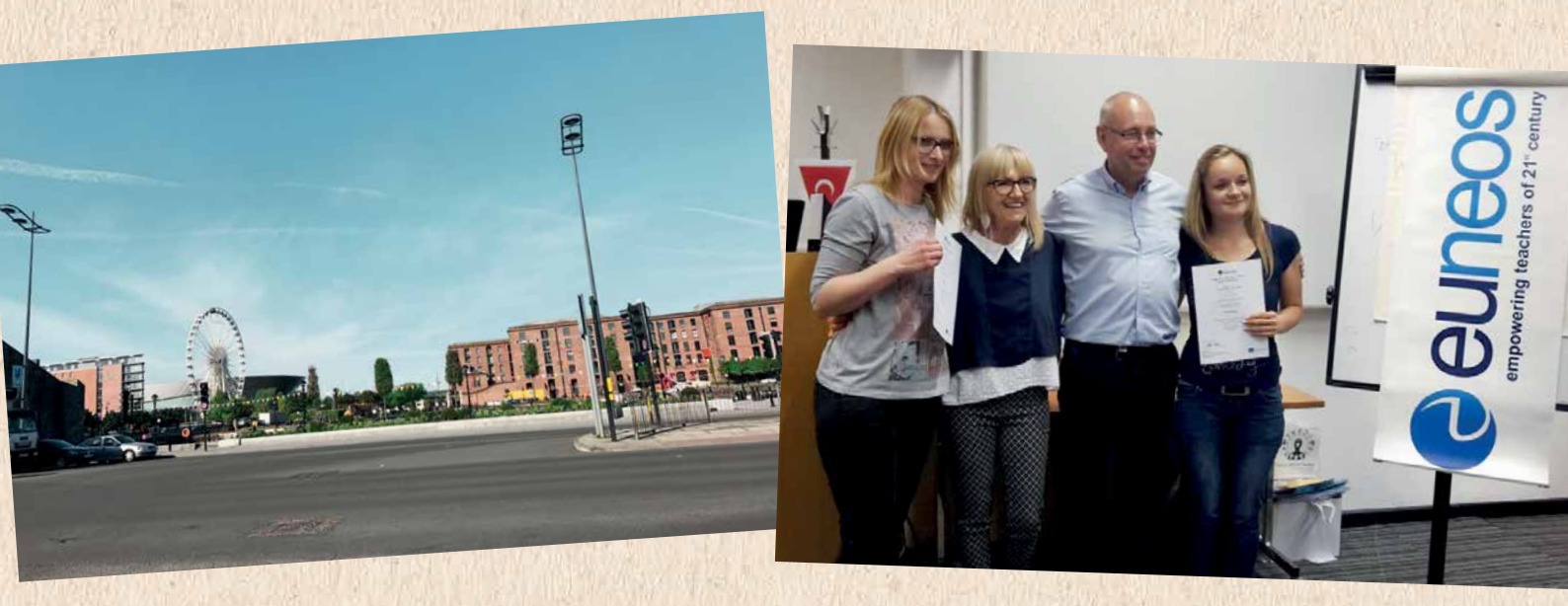
To be up-to-date with what is going on, visit our website: www.iatefl2.splet.arnes.si

excellent and offered us a lot. We also agreed that there was a lot more each individual participant had to do afterwards if they were serious about using tablets in their classes. Certainly there can be a lot of advantages to using tablets in the classroom, but it's also important to be sure to use them wisely!